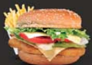
23 برجر دجاج فيليه Chi. Fillet Burger 9.00