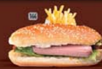
28 8.00 مشاوي العملاق Mega Hotdog