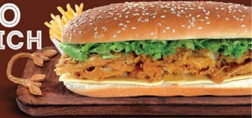
25 12.00 زنگر سبيسي ZINKER SPICY