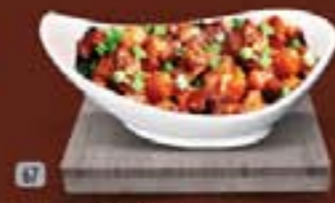
68 جوس منشوريان Gobi Manchurian 13.00