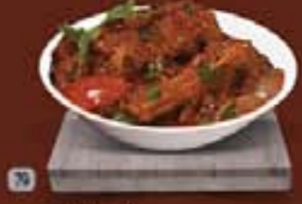
79 خيم روست Mutton Roast 16.00