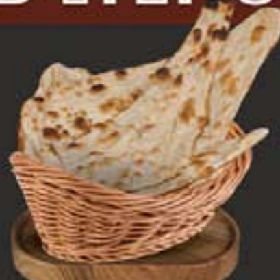
98 نان NAN 2.00