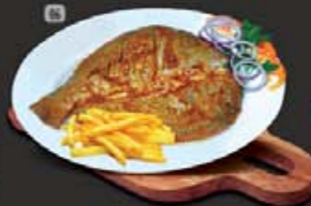
SEASONAL PRICE شيري مشاوي GRILLED SHERRY