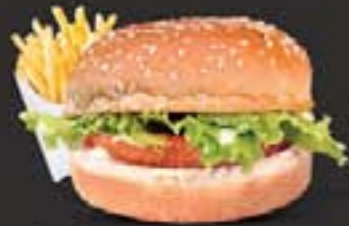
13 برجر خضار Veg Burger 8.00