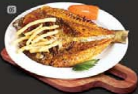
SEASONAL PRICE هامور مشاوي GRILLED HAMOOR