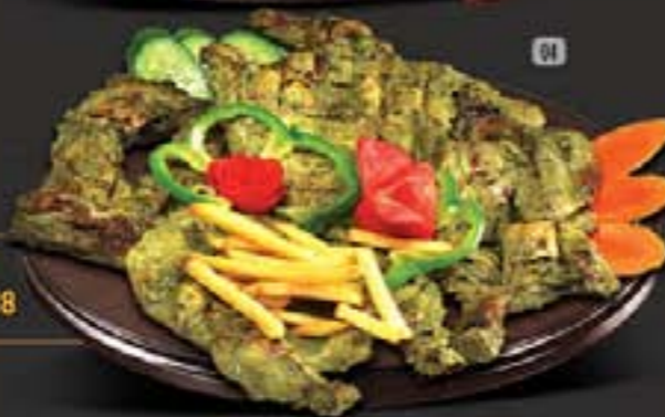
DHS. 20/38 اخضر شيلي GREEN CHILLY