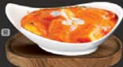
93 پانیئر لابیڈار PANEER LABABDAR 15.00