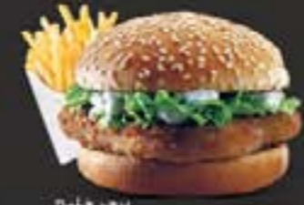
18 برجر خليج Khaleej Burger 10.00