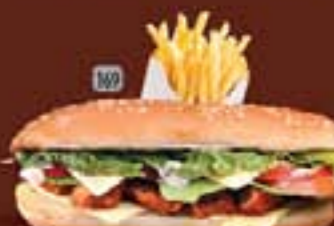
31 10.00 شيش طاووق Sheesh Tawook