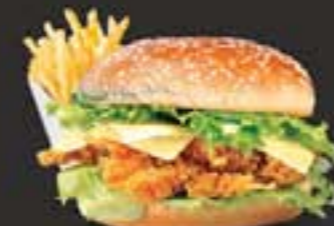
24 برجر زنگر Zinker Burger 13.00