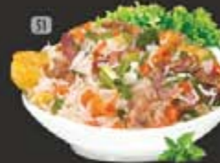
51 ارز مقلي مشكل Mix Fried Rice 18.00