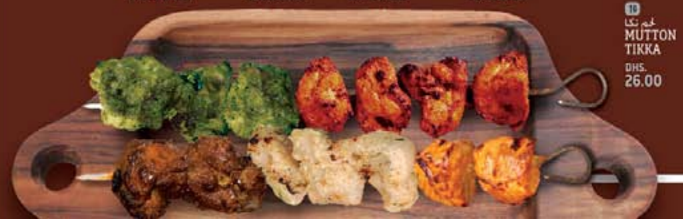
DHS. 26.00 لحم تكا MUTTON TIKKA