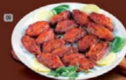
DHS. 20.00 دجاج جواتح CHICKEN WINGS