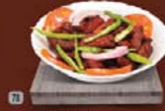
78 خيم بقر مقلي Beef Fry 15.00