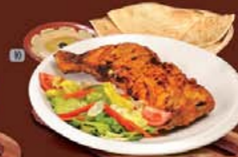
DHS. 12.00 دجاج مشاوي (مع الخدمة) GRILLED CHICKEN (WITH SERVICE)