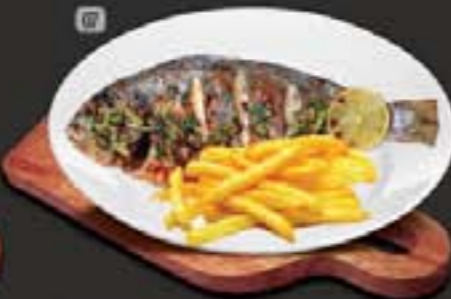
SEASONAL PRICE سمبر مشاوي GRILLED SEA BREAM