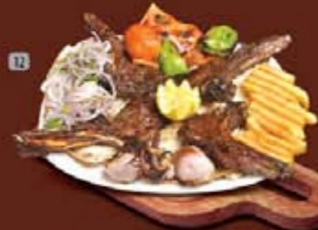
DHS. 30.00 ريش LAMB CHOPS