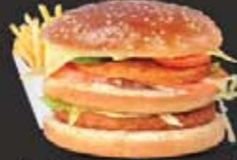
15 برجر ميروك (دجاج / لحم بقر) Mabrook burger (chi./beef) 17.00