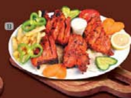
DHS. 25.00 دجاج تندوري CHI. TANDOORI