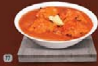
77 زبدة دجاج Butter Chicken 16.00