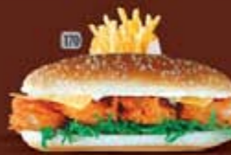
32 12.00 روبيان زنگر Zinker Prawns