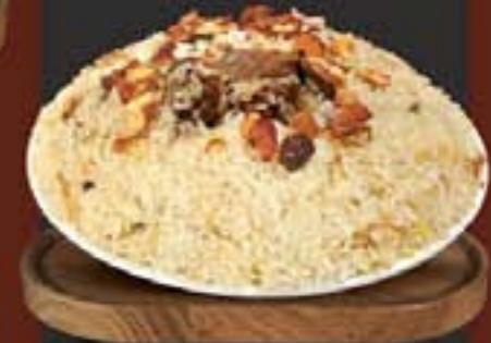
44 لحم بيرياني MUTTON BIRIYANI 16.00 45 لغون دجاج بيرياني LEGHORN CHICKEN BIRIYANI 14.00