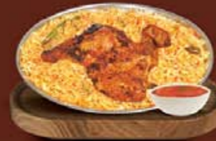
40 دجاج مشوي مع مندي ارز + شوربة GRILL CHICKEN WITH MANDI RICE + SOUP 15.00