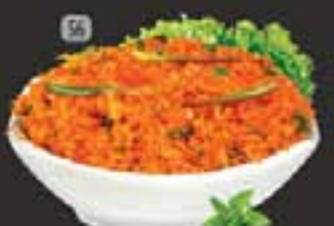
56 ارز مقلي دجاج شيزوان Schezwan Chi. Fried Rice 17.00