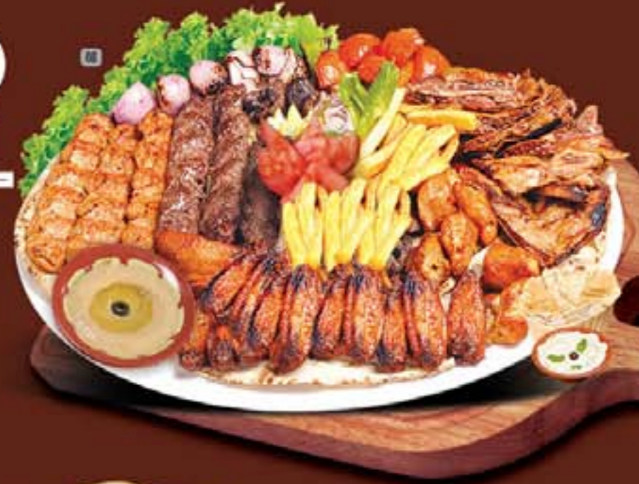
مشاوي مشكل خاص MIX GRILL SPECIAL