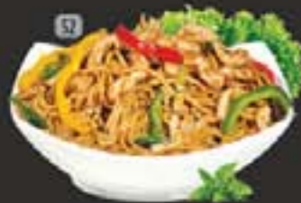
52 معكرونه دجاج Chicken Noodles 13.00