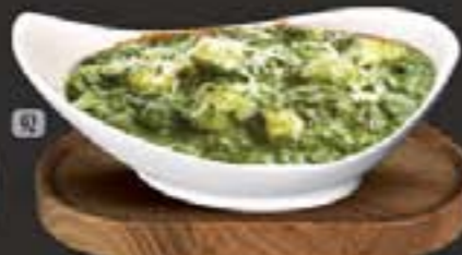
92 آلو پالاک ALOO PALAK 7/11