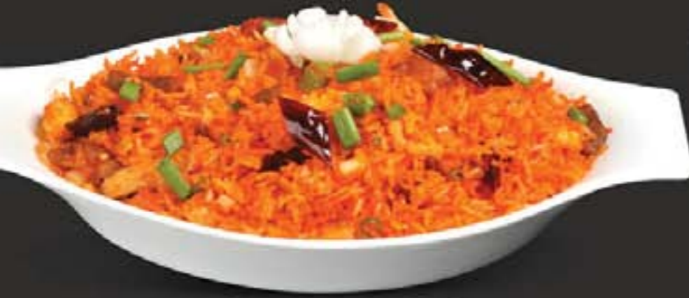
47 ارز مقلي شيزوان / معكرونه (روبيان/مشكل) SCHEZWAN FRIED RICE/NOODLES (PRAWNS/MIX) 18.00

This rice is a dish of steamed rice stir-fried in a wok, often served with other ingredients, such as egg, mushrooms, and meat. It is sometimes served in the traditional style of Chinese 'chow mein' but without sauce.