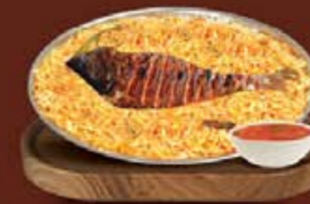
41 شيري مع مندي ارز + شوربة SHERRY WITH MANDI RICE + SOUP SEASONAL PRICE