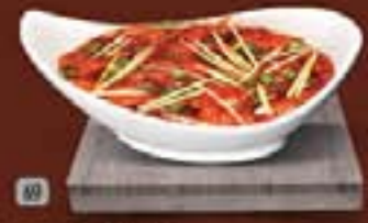
70 دجاج زنجبيل Ginger Chicken 16.00