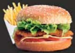
17 برجر سمك Fish Burger 10.00