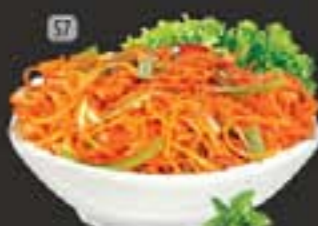
57 معكرونه دجاج شيزوان Schezwan Chi. Noodles 17.00