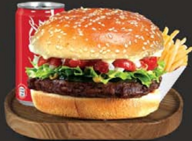
12 برجر مشاوي GRILLED BURGER 18.00