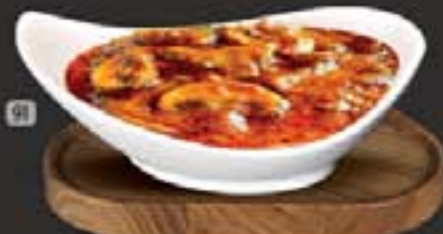
91 مشروم مسالا MUSHROOM MASALA 16.00