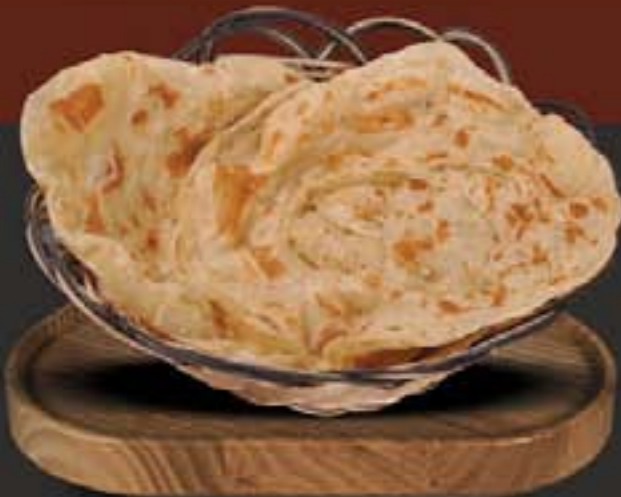
94 پاراٹھا PARATHA 1.00