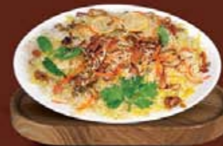
38 دجاج بيرياني CHICKEN BIRIYANI 12.00