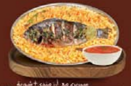
43 سموريم مع ارز مندي + شوربة SEA BREAM WITH MANDI RICE + SOUP SEASONAL PRICE