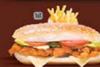
27 11.00 زنگر كومبو Zinker Combo