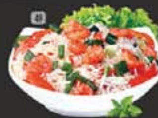
49 ارز مقلي روبیان Prawns Fried Rice 18.00