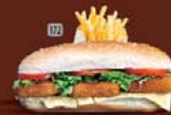
34 11.00 كومبو قطع دجاج Nuggets Combo