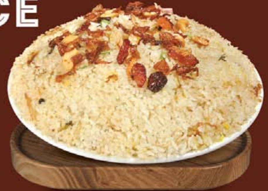
37 لحم بقر بيرياني BEEF BIRIYANI 13.00

Biryani, also known as biryani, biriani, birani or briyani, is a mixed rice dish with its origins among the Muslims of the Indian subcontinent. This dish is especially popular throughout the Indian subcontinent, as well as among the diaspora from the region.