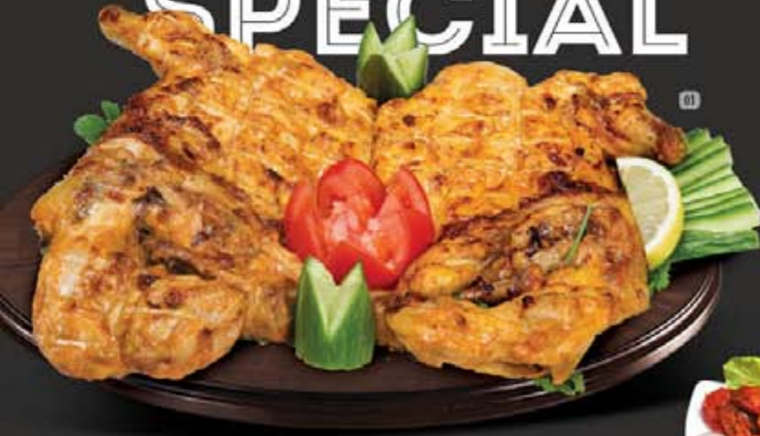
DHS. 18/35 دكان المشاوي دجاج على الفحم خاص SPOT GRILL SPL. CHICKEN CHARCOAL