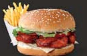
22 برجر تندوري Tandoori Burger 11.00