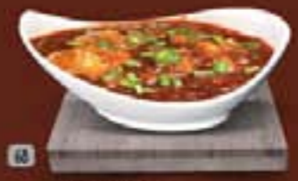
69 دجاج منشوريان Chicken Manchurian 16.00