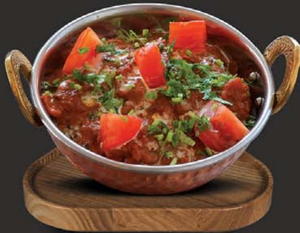
90 كدای پانیئر KADAI PANEER 20.00

Dal paneer is a preparation of paneer, originating from the Indian subcontinent, in a thick gravy made up of cream, tomatoes and Indian spices. It is mainly eaten with rice, roti, rice, other breads. Paneer is the word for cottage cheese, and dal is the term for lentils.