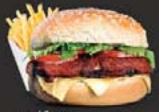
20 برجر كاجون Cajun Burger 11.00