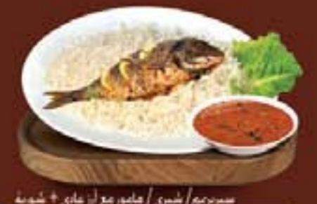
46 سموريم / شيري / هامور مع ارز عادي + شوربة SEA BREAM / SHERY / HAMOUR WITH PLAIN RICE + SOUP SEASONAL PRICE