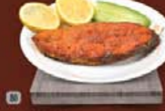
80 سمك مقلي Fish Fry SEASONAL PRICE