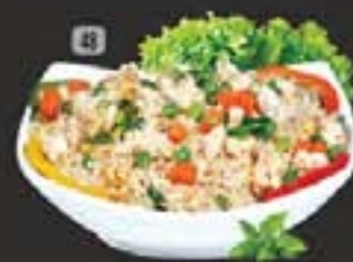
48 ارز مقلي دجاج Chicken Fried Rice 13.00

This rice is a dish of steamed rice stir-fried in a wok, often served with other ingredients, such as egg, mushrooms, and meat. It is sometimes served in the traditional style of Chinese 'chow mein' but without sauce.