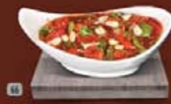
67 دجاج بالثوم Garlic Chicken 16.00