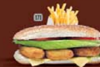
33 11.00 روبيان جمبو Jumbo Prawns