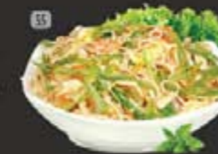
55 معكرونه مشكل Mix Noodles 18.00