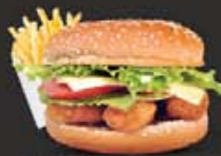
14 جمبو روبيان Jumbo Prawn 10.00