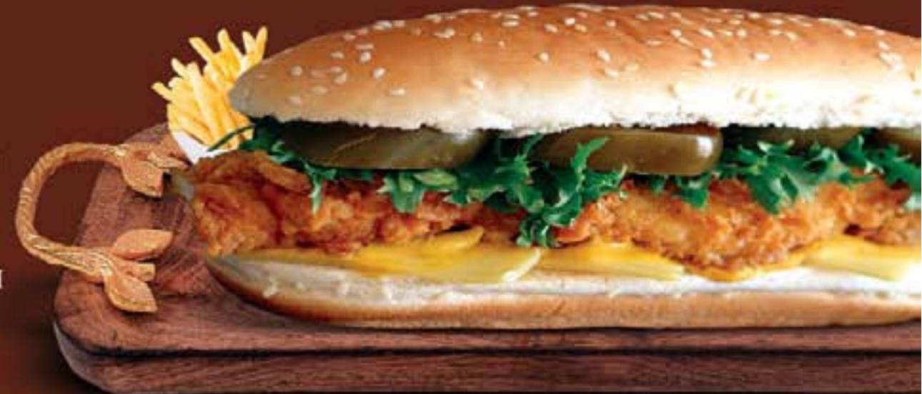
35 13.00 سموير ماثافي SUPER MATHAFI