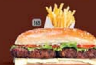
30 14.00 كباب كومبو Kabab Combo