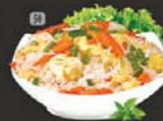
50 ارز مقلي بيض/خضار Egg/Veg Fried Rice 12.00