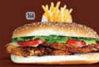
26 10.00 دجاج ليمون Chi. Lemon