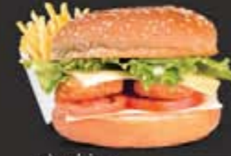
21 برجر قطع دجاج Nuggets Burger 10.00