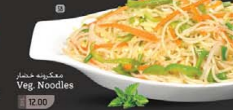
58 معكرونه خضار Veg. Noodles 12.00