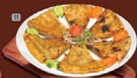
DHS. 22.00 عرايس ARAYES