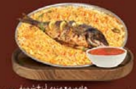
42 هامور مع مندي ارز + شوربة HAMOUR WITH MANDI RICE + SOUP SEASONAL PRICE