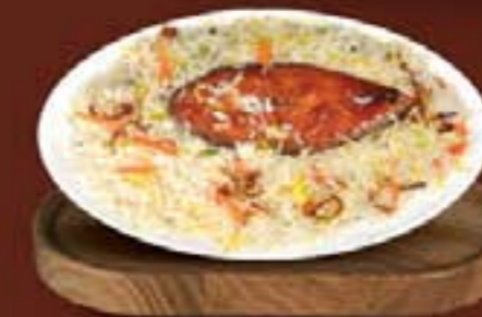
39 سمك بيرياني FISH BIRIYANI 14.00