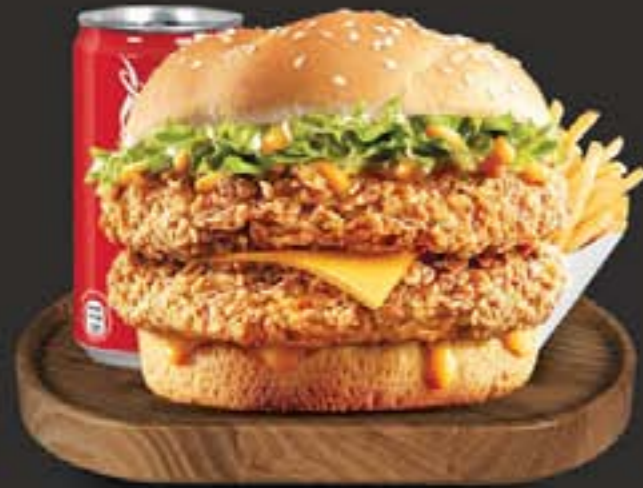
11 زنگر دبل ZINKER DOUBLE 18.00

A sandwich is a food typically consisting of vegetables, sliced cheese or meat, placed on or between slices of bread, or more generally any dish wherein two or more pieces of bread serve as a container or wrapper for another food item.