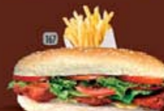
29 11.00 دجاج توكا Chicken Tikka