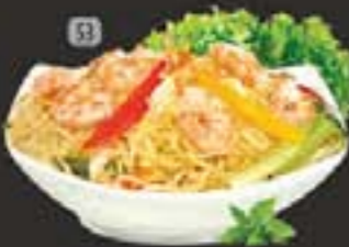
53 معكرونه روبیان Prawns Noodles 18.00