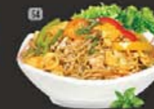
54 معكرونه بيض Egg Noodles 12.00