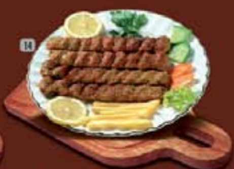
DHS. 23/25 كباب (دجاج/لحم) KEBAB (CHI/MUTTON)