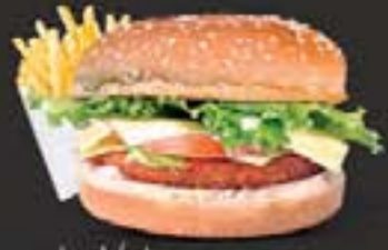
16 برجر دجاج / لحم بقر Chi/Beef Burger 7.00