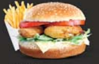
19 برجر روبيان Prawns Burger 10.00